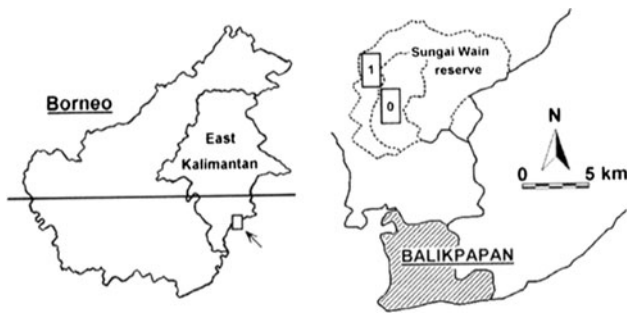
Fig. 1 Map indicating the location of the research area sites in Borneo (arrow in left map). Two 450-ha plots were established in unburned (0) and adjacent burned (1) forest (right map)

poor and sandy and the topography covers an elevation gradient of 10–120 m above sea level. The area includes freshwater swamps, coastal tidal areas, periodically inundated river valleys and low hill ridges. The vegetation composition and forest structure is typical for lowland coastal forests in eastern Borneo, with forests within a 30-km radius of the research area showing high floristic and structural similarity (Slik et al. 2003; Eichhorn 2006; Slik et al. 2009; Slik et al. 2010).